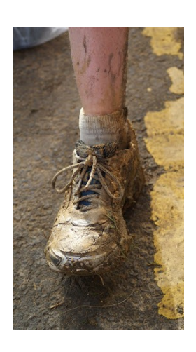
Full Monty Roundup

Well the final event of the year has been and gone and as usual it was a great success! The weather held out and gave us near perfect running conditions for the 240ish runners who took part on a grueling 10 mile course.